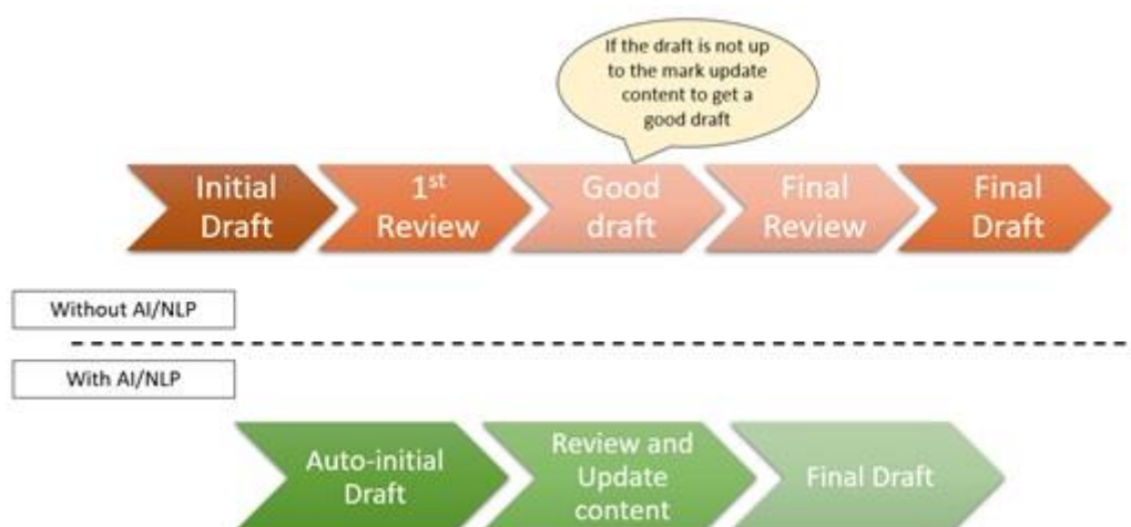
Figure 2: The Traditional Approach of Medical Writing Vs. Adopting the AI/NLP Solution for Medical Writing

MWA is especially useful for repetitive activities with a high level of redundancy. Most of the time and effort devoted to developing these documents is spent acquiring data from pre-existing sources (such as study procedures, figures, tables, and statistical analyses) and organising them under appropriate section headings. The figure below (Figure 2) explains how the AI/NLP solution can reduce 50–80 per cent of the time, as compared to the traditional approach.