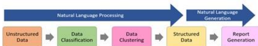
Figure 1: NLP and NLG Assisting in the Medical Writing Process

AI, combined with NLP and NLG, automatically extracts information from a wide range of data sets, whether structured or unstructured. The extracted data is subsequently analysed to interpret and categorise the substance and context of the information, and the content and context data are stored in a dynamic semantic model. The diagram below (Figure 1) depicts how NLP and NLG aid the medical writing process, making it more efficient.